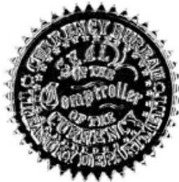
Comptroller of the Currency

IN TESTIMONY WHEREOF, today, February 27, 2013, I have hereunto subscribed my name and caused my seal of office to be affixed to these presents at the U.S. Department of the Treasury, in the City of Washington, District of Columbia.