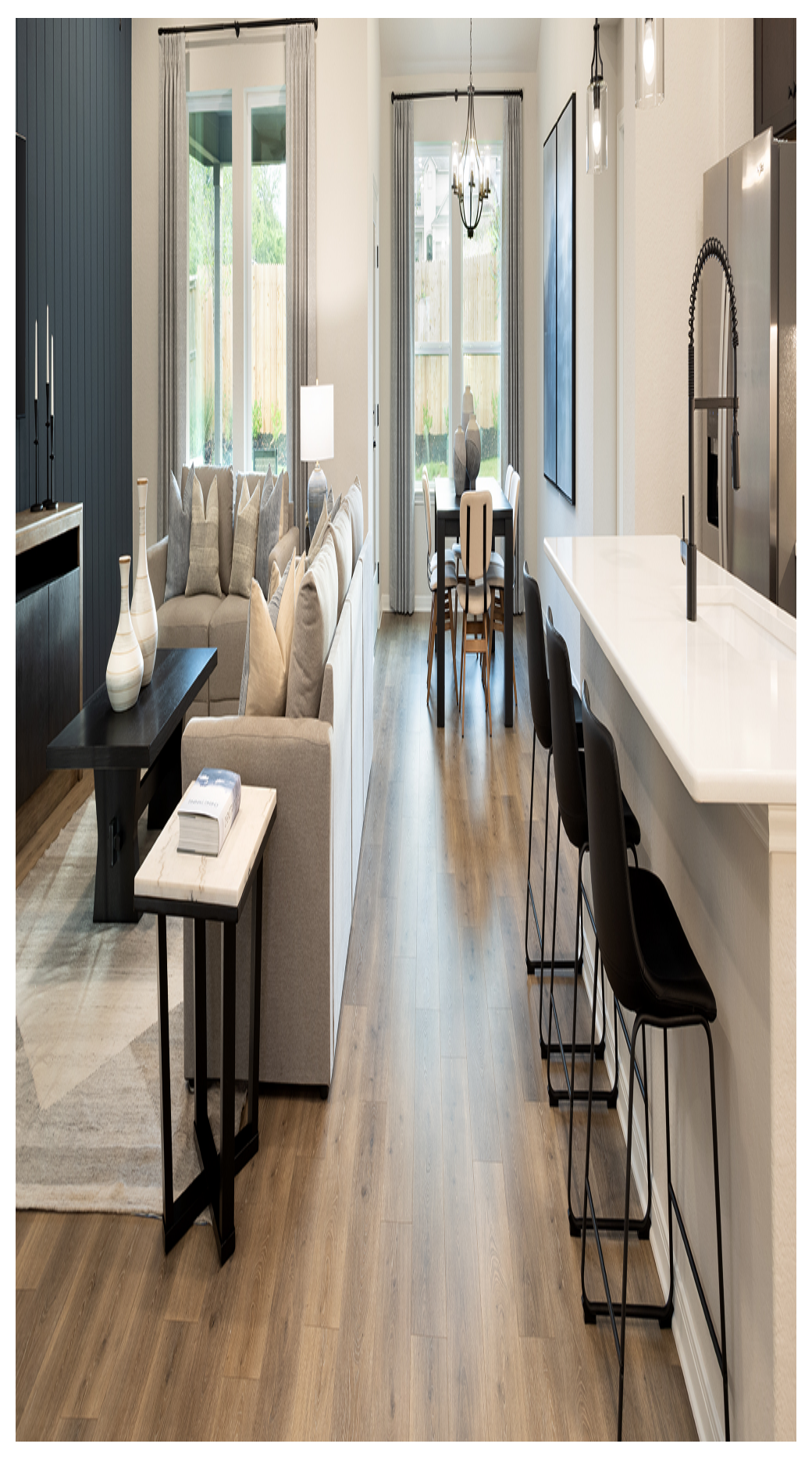
Beazer Homes has 13 communities in development in metro San Antonio, including Seguin, San Antonio, New Braunfels, Helotes, Cibolo, Schertz, and Universal City. Each community offers Zero Energy Ready homes. "We are excited to continue to bring energy-efficient homes to San Antonio and