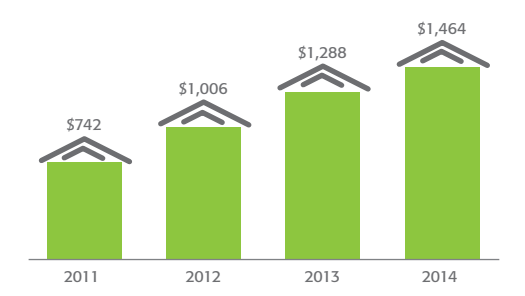
Solid improvement in sales per community per month and much higher average selling prices due to a better mix of communities led to 97% growth in total revenue.