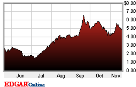
■ BEAZER HOMES USA INC as of 11/19/2009